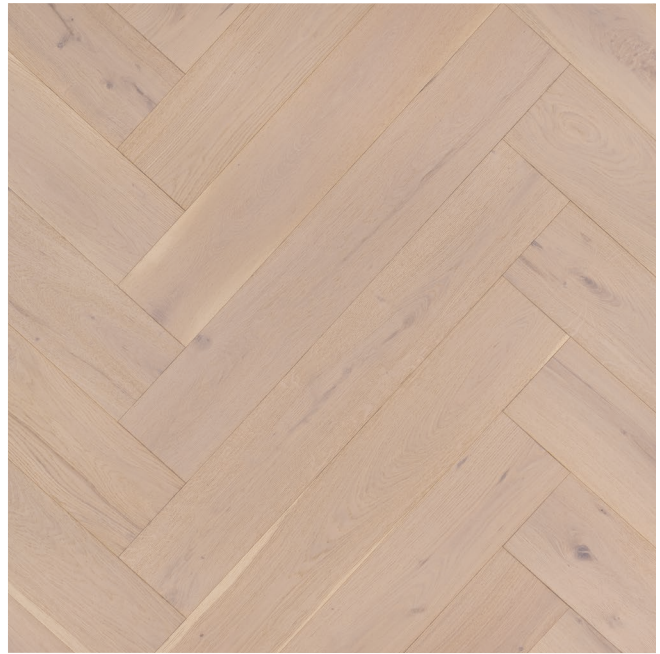
Bayview in Architectural Herringbone