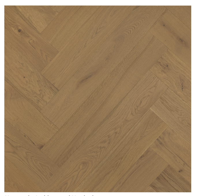
Uptown in Architectural Herringbone